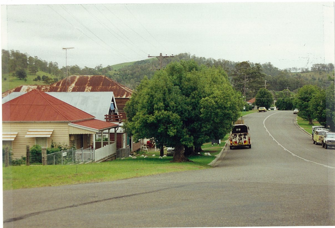
The village of Krumbach on The Bucketts Way

The natural vegetation community is of Forest Red Gum ( Eucalyptus tereticornis ) and Grey Box ( E. moluccana ), with dry rainforest on protected slopes and gullies.